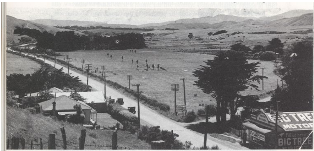
Tawa Flat (corner of the Main Road and today's Oxford Street, formerly the Old Porirua Road) in 1930. Mexted's Garage on the left; the Tawa Flat Store on the right.

It is within Tawa that the old Porirua Road is now much more difficult to find. This is largely because the Road initially was built close to the old Moari trail from Porirua harbour to Wellington's harbour, which in turn was close to the Kenepuru/Porirua Stream. However, this meandering stream, and the removal of the forest cover, quickly led to flooding, and a need to move the Porirua Road westward to higher ground. Well over half of today's Main Road in Tawa lies to the west of the old Porirua Road.